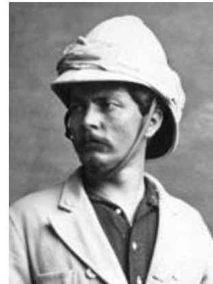
Dr D Livingstone

28 Oct 1871: In Tanzania, Henry Morton Stanley locates "missing" British missionary and explorer Dr David Livingstone, and his first words to him were: "Dr Livingstone, I presume?"